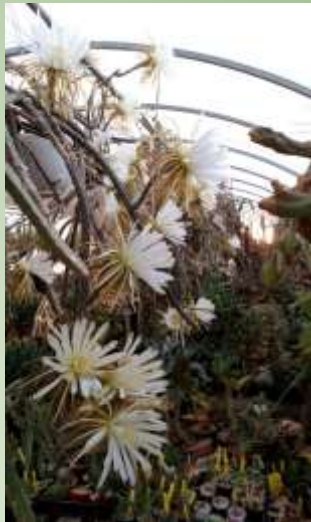
Selenicereus (Night Blooming Cereus)

Summer is here and it is time to enjoy and rejuvenate our plants. Plants are actively growing and it is a good time to re-pot, primp and propagate. Changing the soil at least every couple of years is a good idea, as the potting media breaks down and should be replaced. I try to re-pot my collection on a three-year rotating basis, as it takes me that long to re-pot the collection. I actually am re-potting every month of the year.