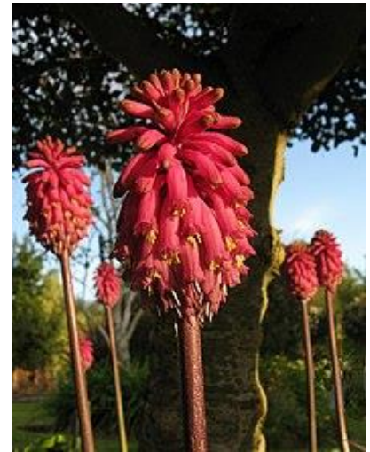
Veltheimia bracteata “Cape Lily”