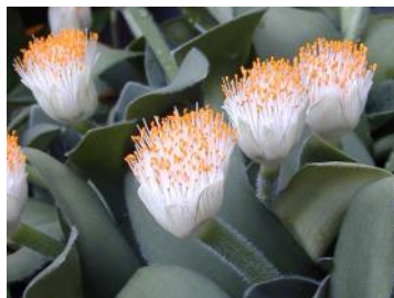
Haemanthus albiflos (“Paintbrush Lily”)