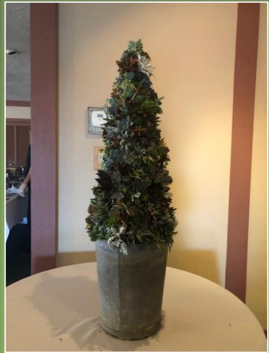
A succulent tree created by Club Member Jeff Havel is on display. This tree was later used to represent the MWCSS club at Cleveland Botanical Garden's winter show, called "Twinkle in the 216."