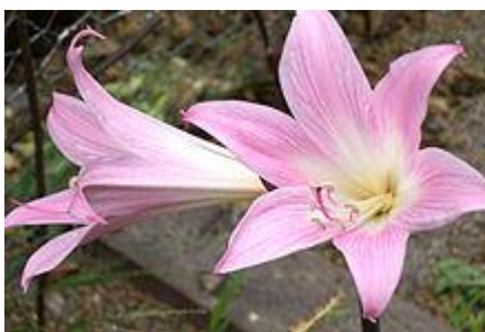
Amaryllis belladonna “Belladonna Lily”