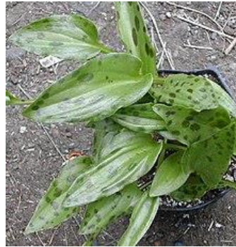
Drimiopsis maculata “Leopard Plant”