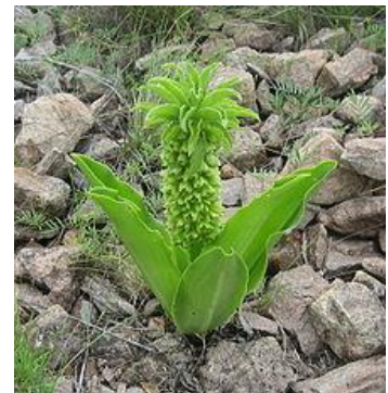
Eucomis species “Pineapple Lily”