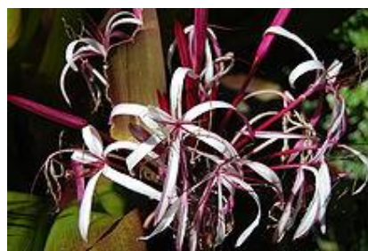
Crinum species “Spider Lily”