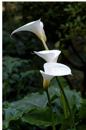
Zantedeschia aethiopica “Calla Lily”