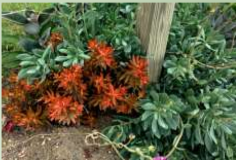
Sedum adolphii 'Firestorm'

Moving plants out for the summer can bring color to succulent foliage impossible to get when they are left indoors. When planted in the garden they also grow more quickly, oftentimes becoming specimen-quality in a short period of time. Plants left in pots also benefit from an outdoor summer vacation. I will leave my plants outside at least until the middle of October and some even later. The cool nights will help set flower buds on many of the plants. I find Jade plants left outside until mid October set bud much better than plants left in the greenhouse all summer (they benefit from the cool night temperatures). The cool nights of October will also help set buds on many of the cacti next spring.