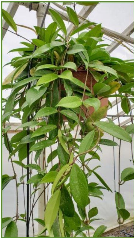
Hoya pubicalyx 'Pink Silver'