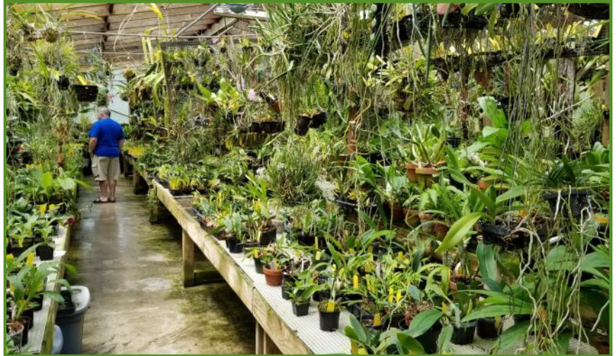
An inside view of the orchid greenhouse at Windswept in Time.

Plants for sale: Orchids and a nice selection of succulents/cacti.